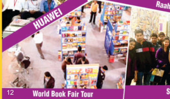
World Book Fair Tour