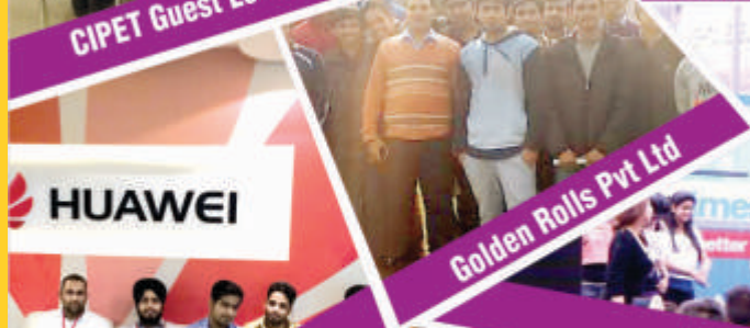
CIPET Guest Lecture