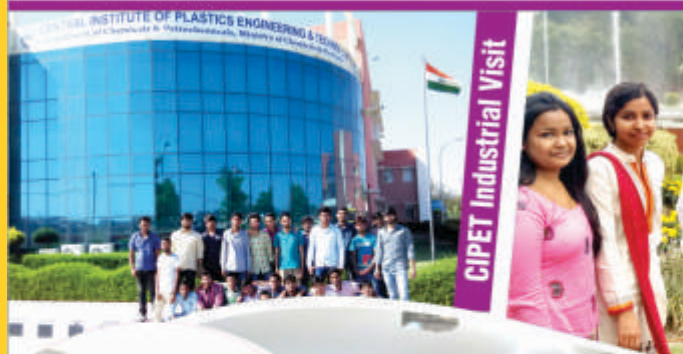
CIPET Industrial Visit