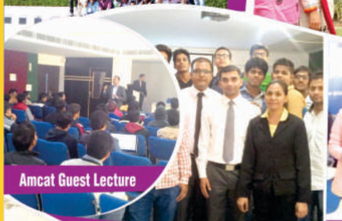
Amcat Guest Lecture